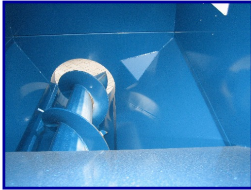
Highly wear and tear resistant screw shaft