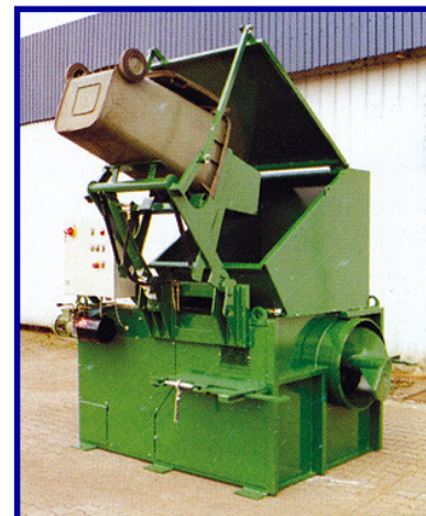
HSP with tipping device