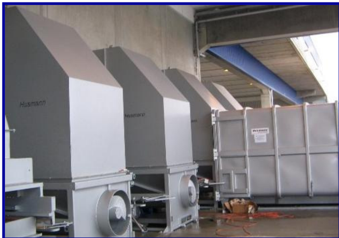
HSP with wall connected chute